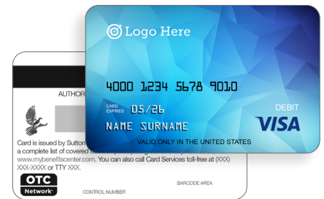
Sample of the Dual Network card