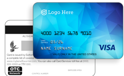
Sample of the Dual Network card