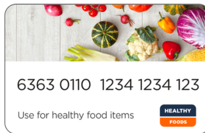
Sample of the healthy foods card